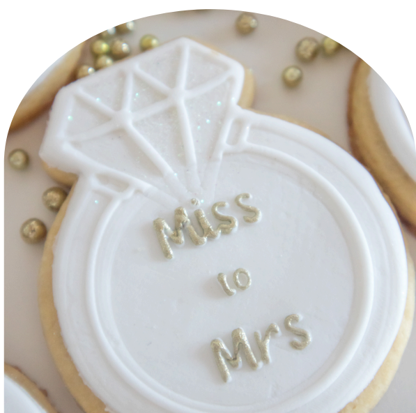
Cookie Gift Boxes

These little cookies are the symbol of luxury in Paris. They are small and sweet and make a great little gift at a wedding