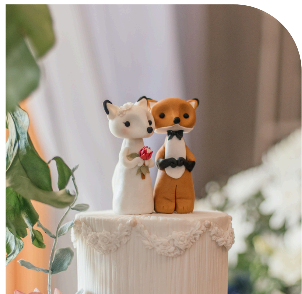
Wedding Cake Toppers

Add your pet to your cake design. Your guest will love this addition to your wedding cake. Its always adorable and special. ( Made from Chocolate)